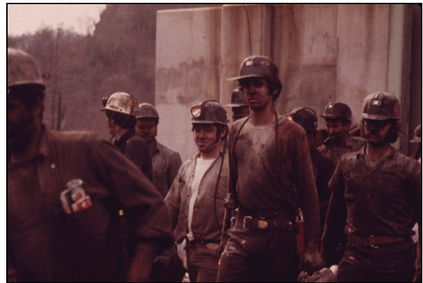
"Miners Just Leaving the Elevator Shaft of Virginia-Pocahontas Coal Company Mine #4 near Richlands, Virginia"

[1] Have you ever heard the phrase “There’s strength in numbers”? For many years, people who worked on farms, in factories, or in other low-wage positions were sometimes forced to endure 1 terrible conditions with little pay. But they soon found, with “strength in numbers,” that they could take charge of their circumstances. That’s where labor unions come in.