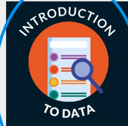
Introduction to Data