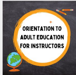
Orientation to Adult Education for Instructors